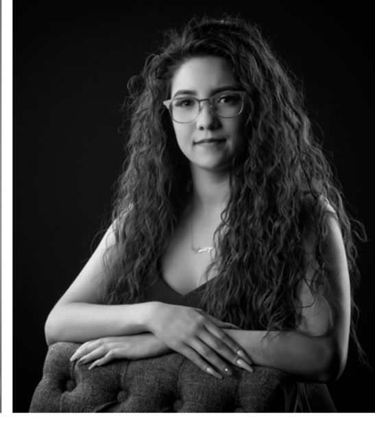
We specialize in relationships. Our artistic approach will capture the intimacy of families, couples, children, and pets. At Townsley Fine Art, we concentrate on making all of our clients feel confident, comfortable, and beautiful. The atmosphere that we have spent decades perfecting has given us the ability to produce stunning results time and time again. Come and experience the best portrait artists in Las Vegas and let's create something beautiful together.

portrait to choose because everyone looked great in every shot. These portraits are truly a work of art and